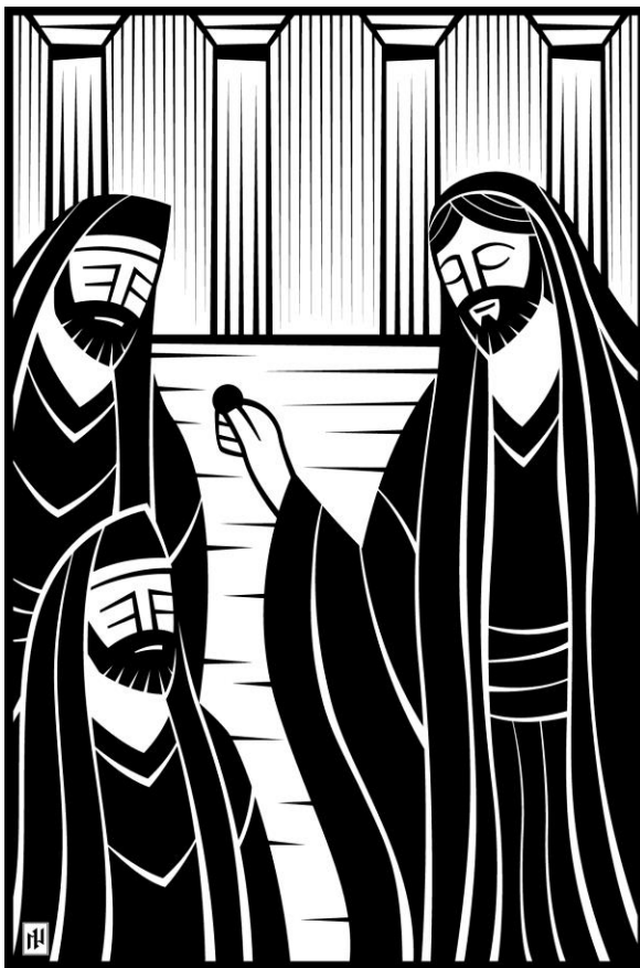
TABLE OF DUTIES GOVERNMENT AND CITIZENS